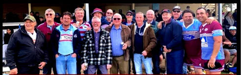
GOONDIWINDI SENIOR RUGBY LEAGUE